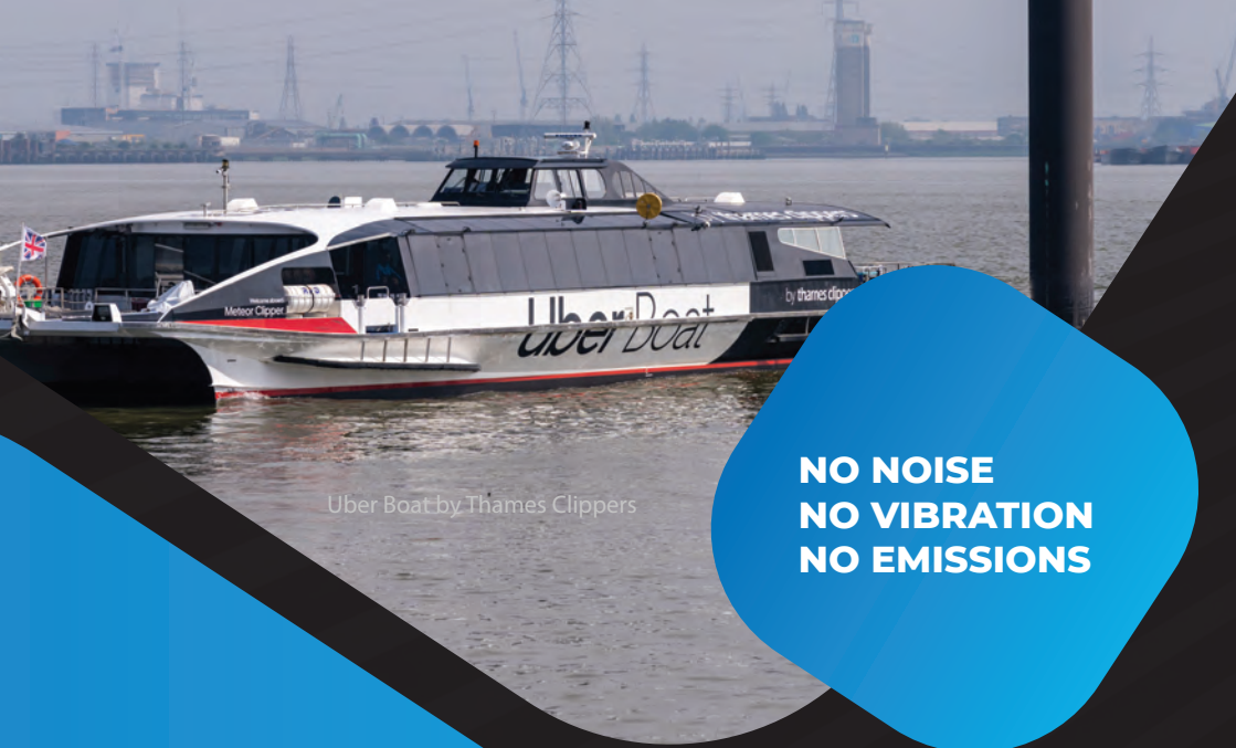
Uber Boat by Thames Clippers